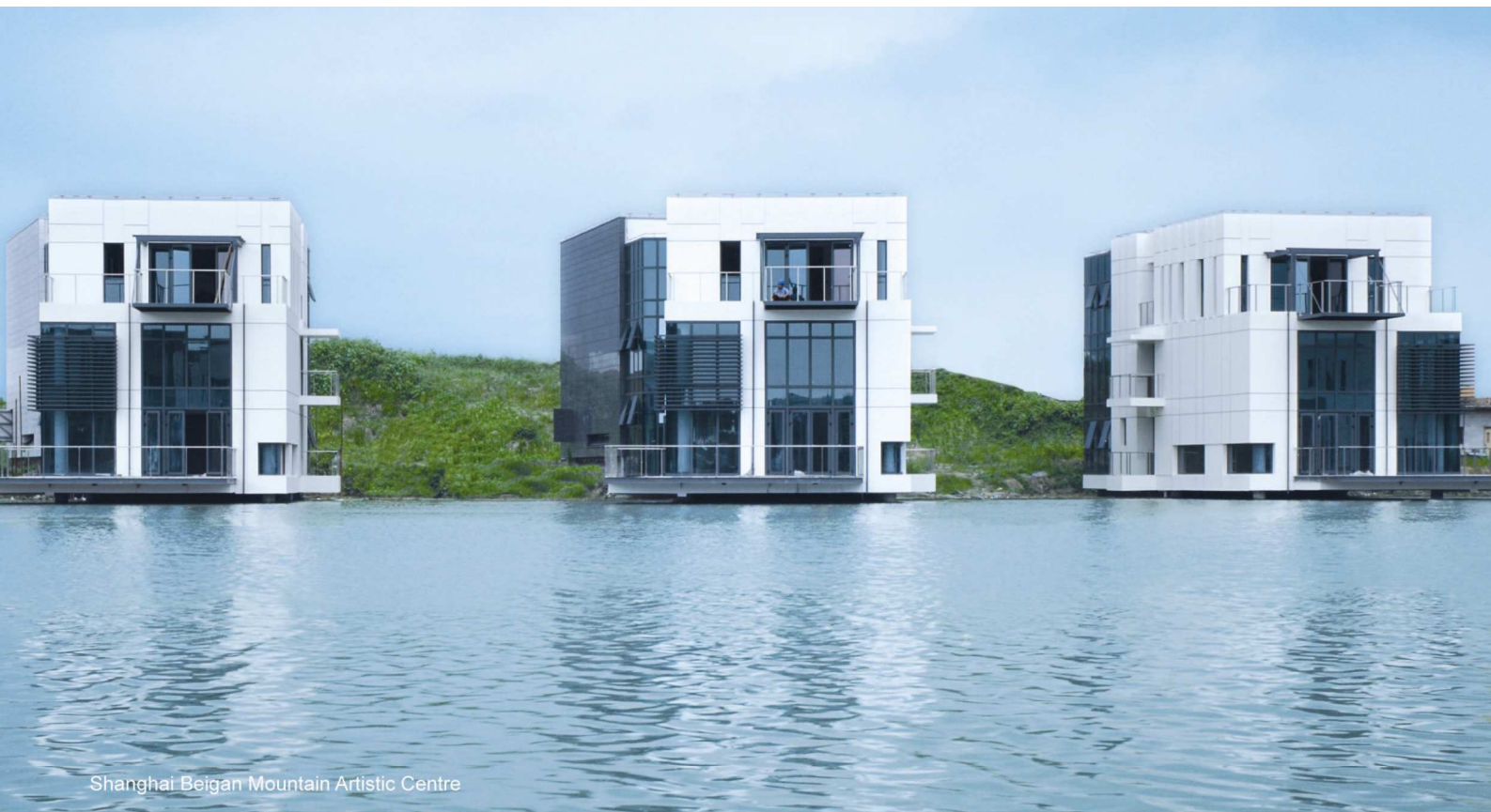
Shanghai Beigan Mountain Artistic Centre