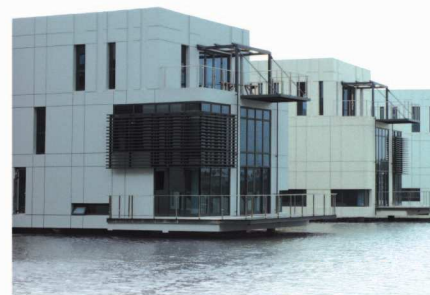
Shanghai Beigan Mountain Artistic Centre