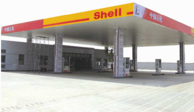
Shell Oil Station

Top grade wall cladding for hotel,exhibition,airport,gas station and so on .