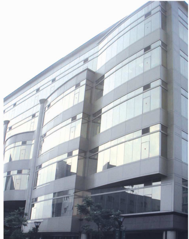
Japan Osaka Project