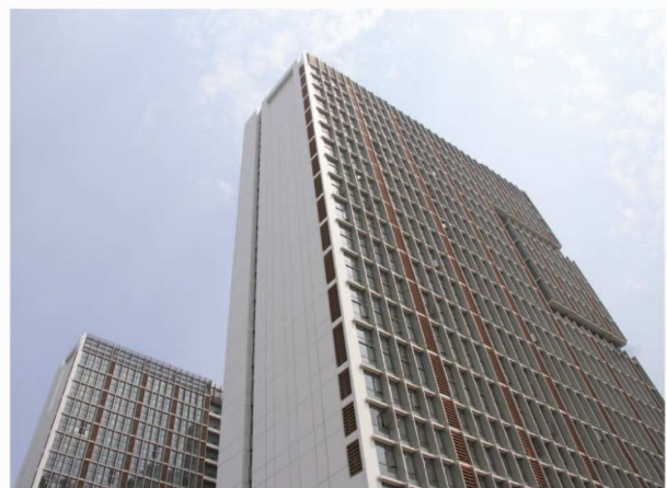
Wuxi Gold Harbor